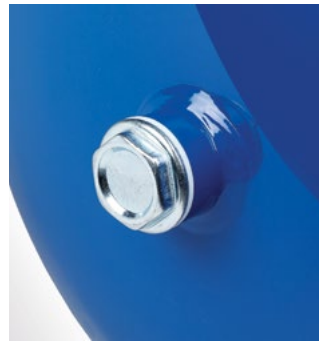
Internally coated receiver

You can find out which model is better suited to your exact application by using our product selector – scan the QR code to find out more.