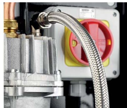
400mm braided hose