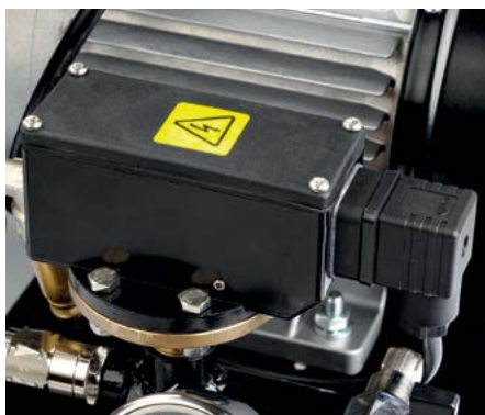
FSP variable pressure switch